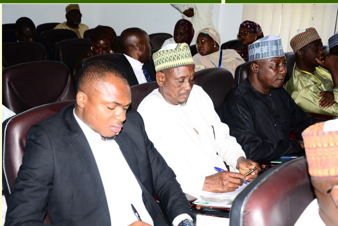
FISSCO engagement in the North West