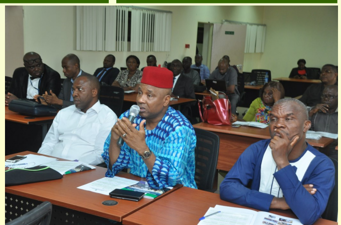
FISSCO engagement in the South East