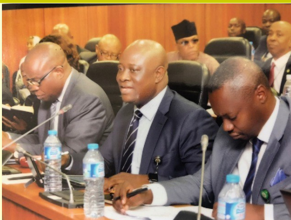
Cross-section of CBN Branch Controllers and members