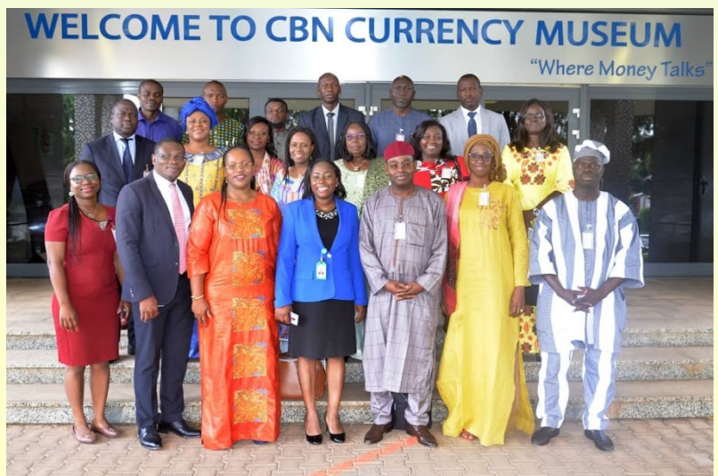
Delegates and the CBN team