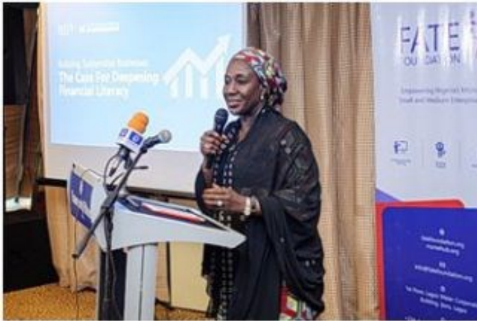
Mrs. Aisha Abubakar, Honorable Minister of State, Industry, Trade and Investment delivering the Keynote Address