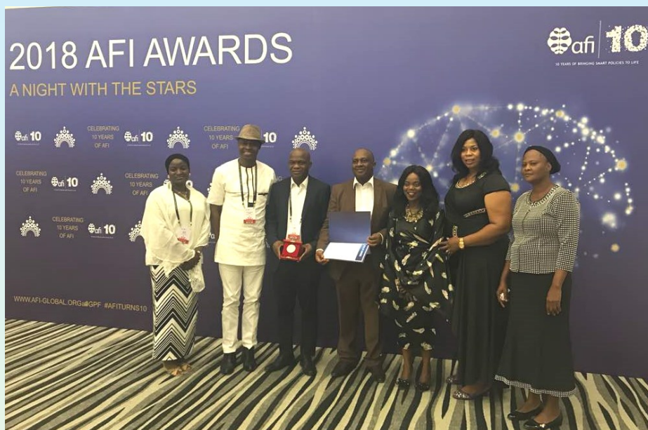
CBN Delegation at the Alliance for Financial Inclusion Global Policy Forum in September, 2018

The Alliance for Financial Inclusion (AFI) and the Bank of Russia co-hosted the 2018 Global Policy Forum (GPF) in Sochi, Russia from the 5th - 7th September 2018. The event, which marked the 10th Anniversary of AFI as an organization as well as the 10th GPF edition was themed "Innovation, Inclusion, Impact" .