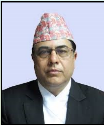
Governor of NRB, Dr. Chiranjibi Nepal