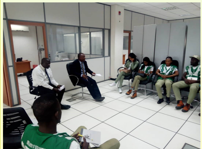
Financial VCMs in Awka South LGA Anambra state paying courtesy call to the Central Bank of Nigeria

During the course of the programme, the VCMs in Awka South LGA Anambra State visited the Central Bank of Nigeria Awka Office to discuss issues arising from the field work. Other key issues on pension and taxation were discussed during the meeting.