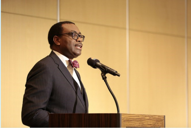
Mr. Akinwunmi Adesina—President, African Development Bank (AFDB)

As part of its efforts to improve the livelihood of Nigerians and improve their quality of life, the African Development Bank is offering a $50 million credit line to Sterling Bank Nigeria Plc to support Micro Small and Medium Enterprises (MSMEs) in sectors strategic to the country's inclusive growth; including Agriculture, Renewable Energy and Social sectors such as Health and Education.