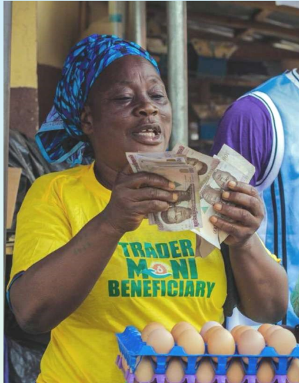
Beneficiary of the Federal Government's TraderMoni scheme

The Formality Gap particularly notes that while 37 million MSMEs exist employing 60 million Nigerians, the sector is still considered to be the most financially excluded in comparison to their counter-