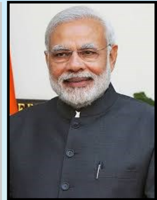
Prime Minister of India, Narendra Modi

PMJDY is the financial inclusion program of the Government of India (GoI) that aims to expand and make affordable, access to financial services. It was launched by Prime Minister Narendra Modi in August 2014. The Guinness Book of Record recognized the achievement of PMJDY when it opened 18million accounts in one week.