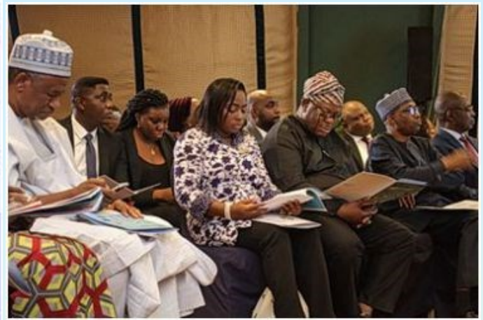
Cross section of Guest Speakers and Participants at the Dialogue

FATE Foundation hosted its 4th Policy Dialogue Series on Entrepreneurship as part of its efforts to improve and deepen financial literacy amongst entrepreneurs in Nigeria.